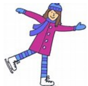
Photo ID required to rent

Skate Rental Fees $4 for adults and $3 for kids