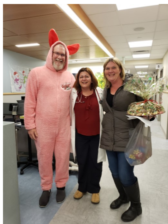
Dr T receiving cookies from a very special patient