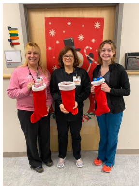
Get Your Rack Back delivered stockings to our Cancer Care Centers for our patients.